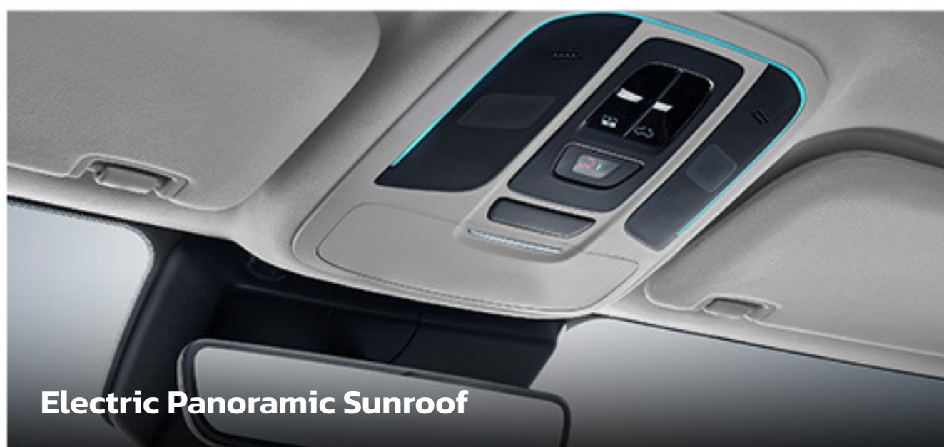
Electric Panoramic Sunroof