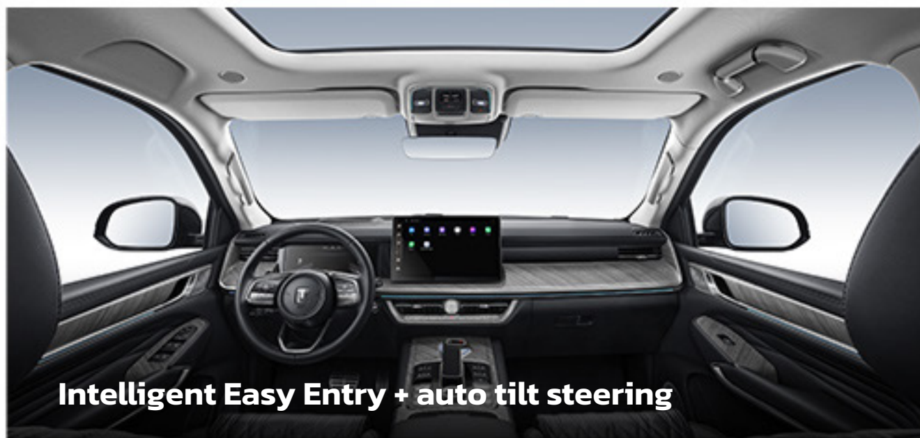
Intelligent Easy Entry + auto tilt steering