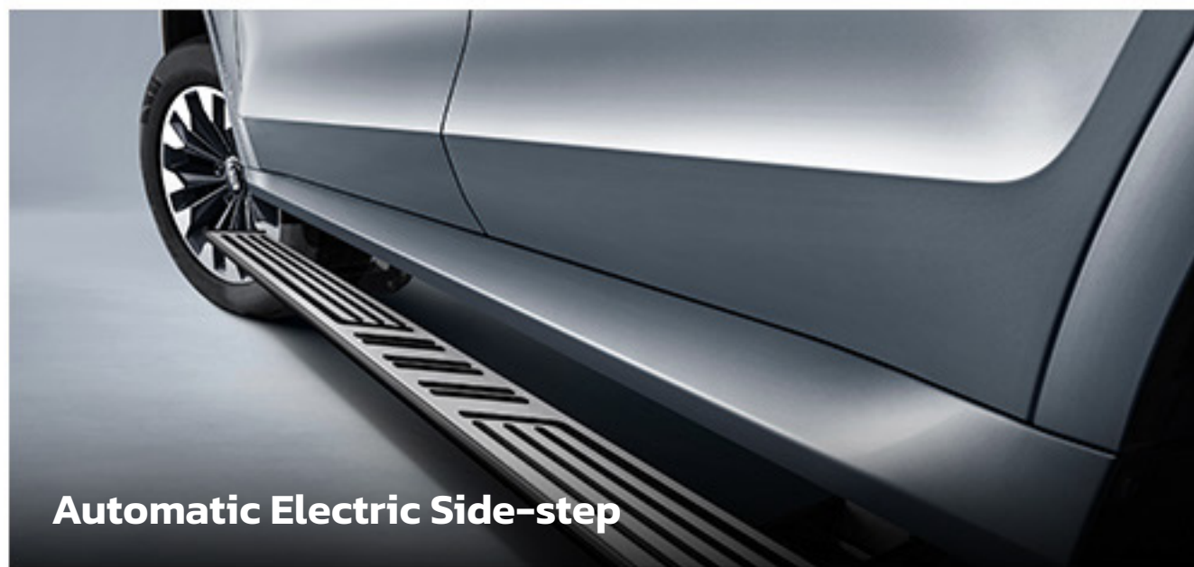
Automatic Electric Side-step