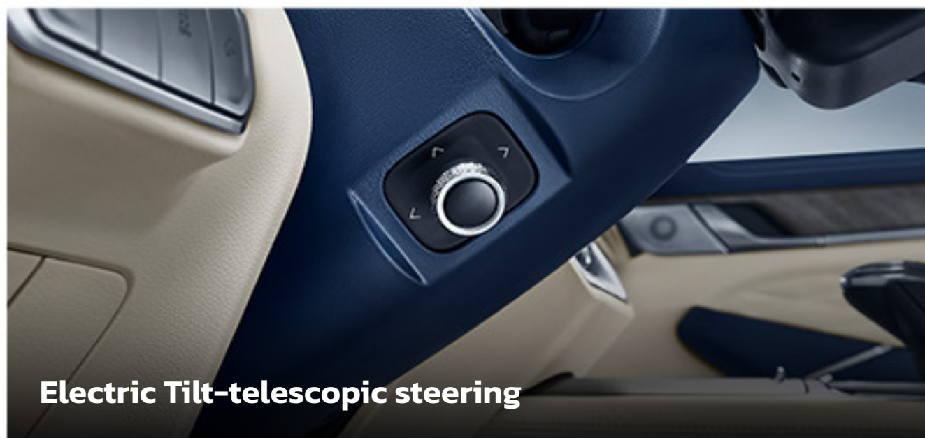
Electric Tilt-telescopic steering