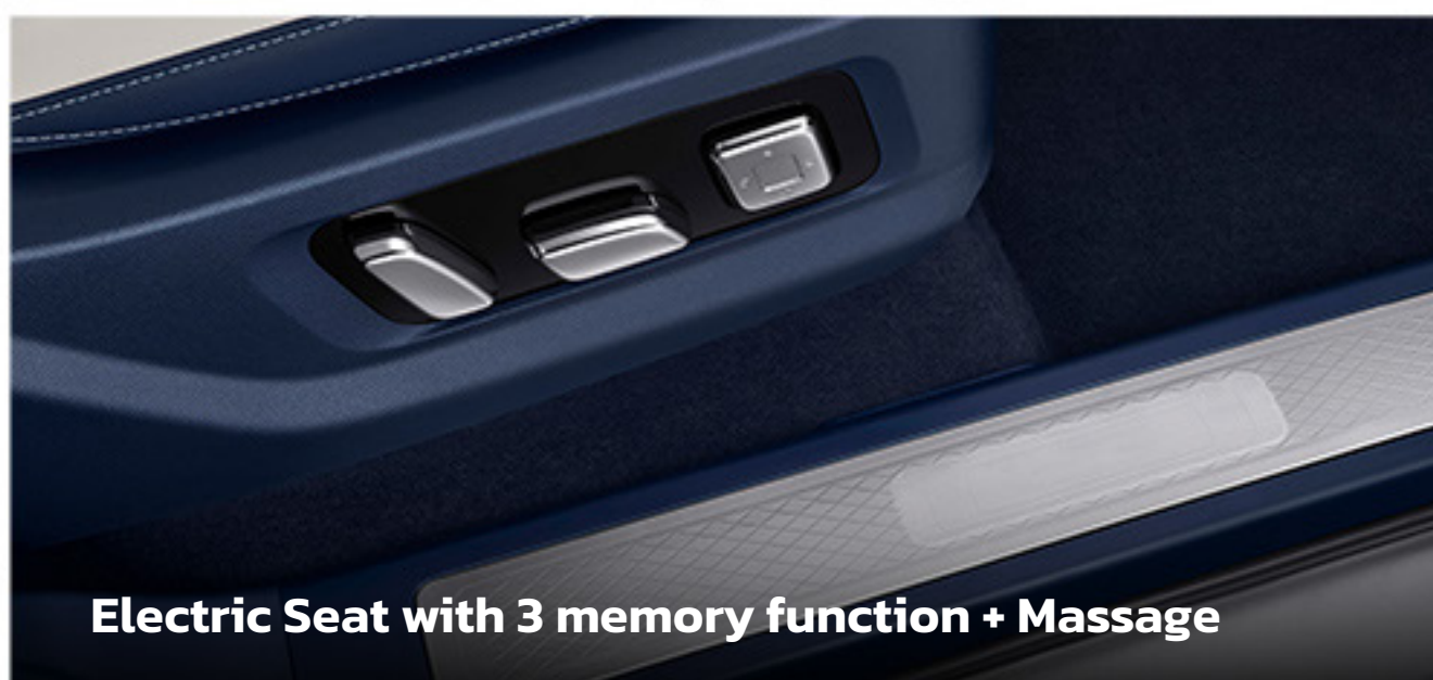
Electric Seat with 3 memory function + Massage