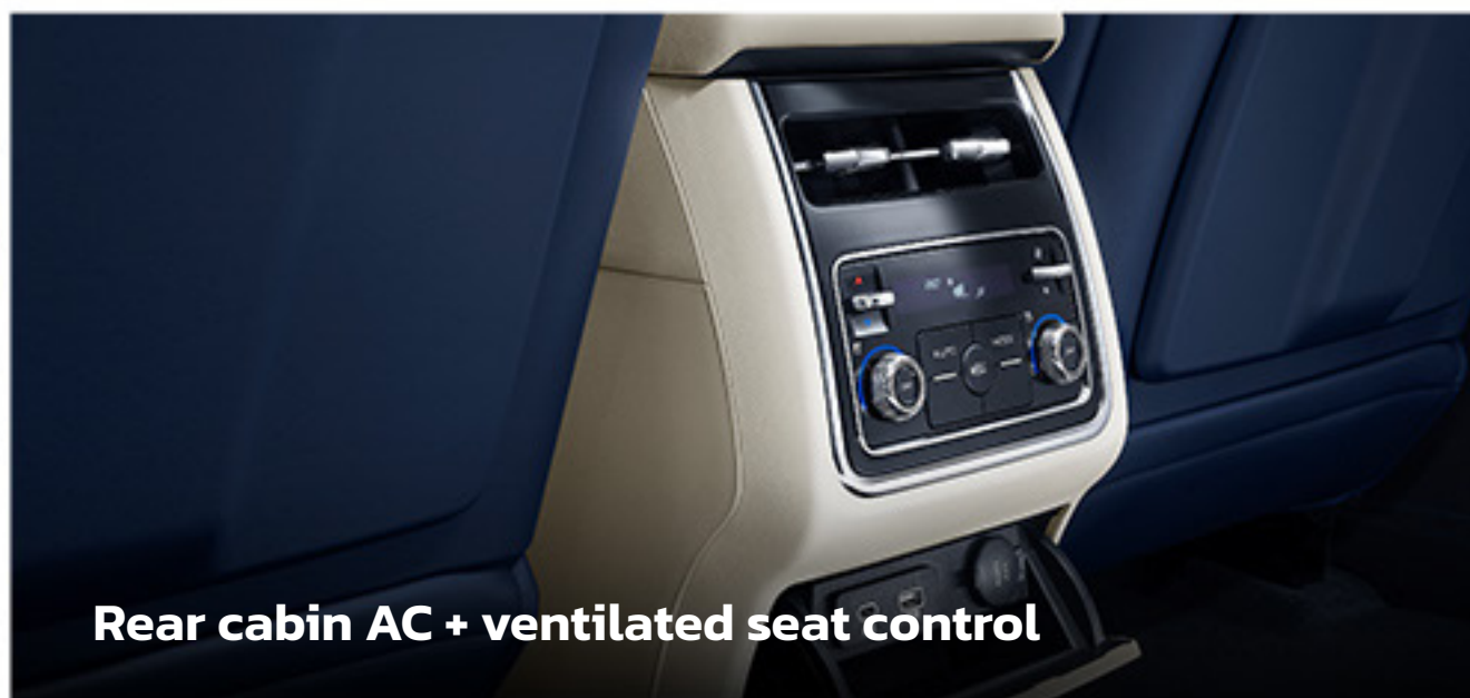
Rear cabin AC + ventilated seat control